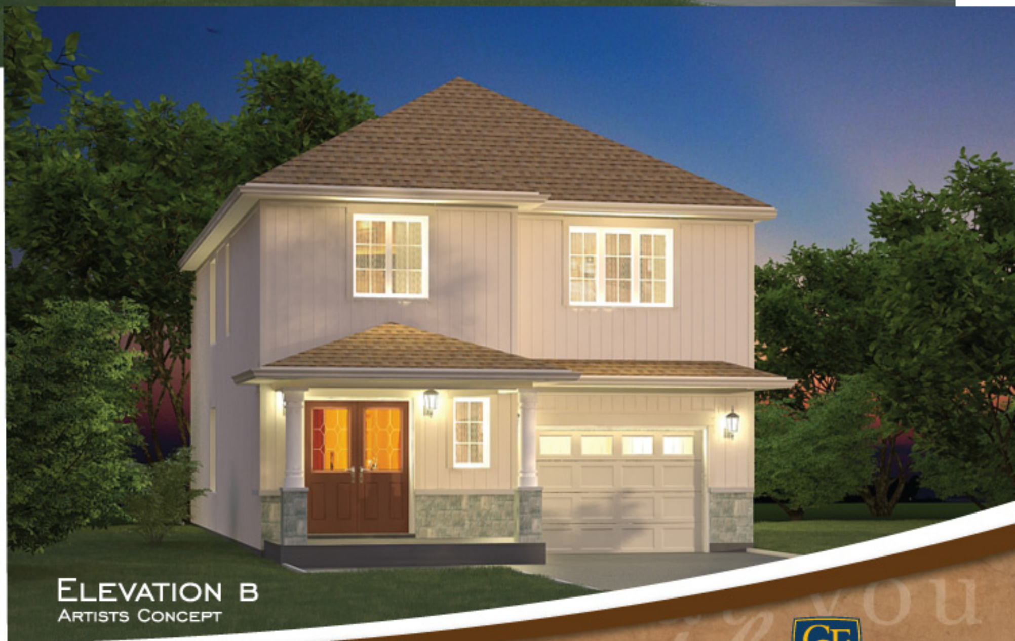
ELEVATION B ARTISTS CONCEPT