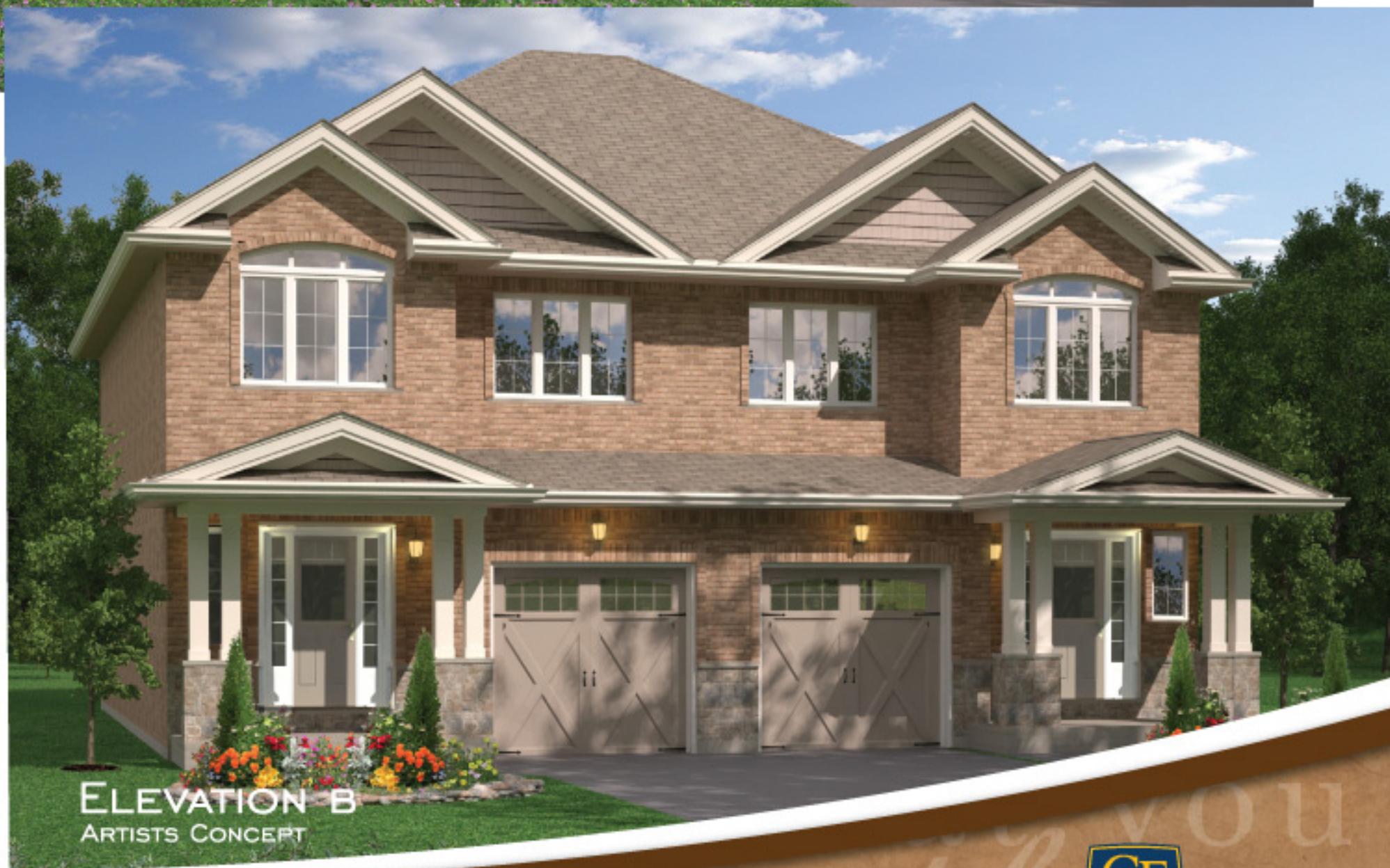
ELEVATION B ARTISTS CONCEPT